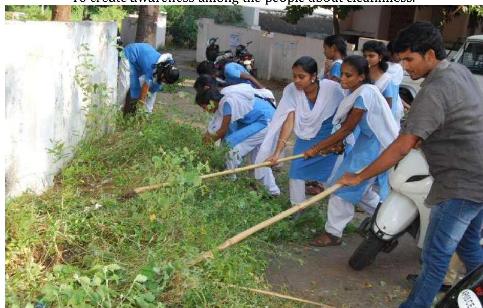
Students participated in cleanliness programme.

To create awareness among the people about cleanliness.